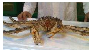
The red king crab says welcome to Bergen (Caught outside Bergen June 09)

For more information please contact the same address.